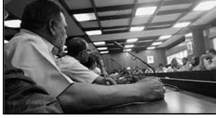
In meeting with Staff Side and Administration Side Officers.